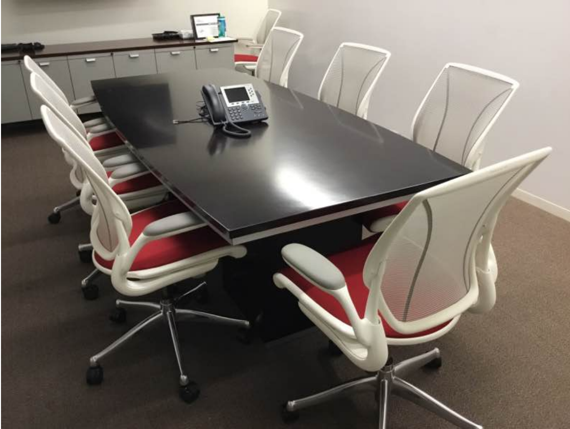
Table size 8' x 41"