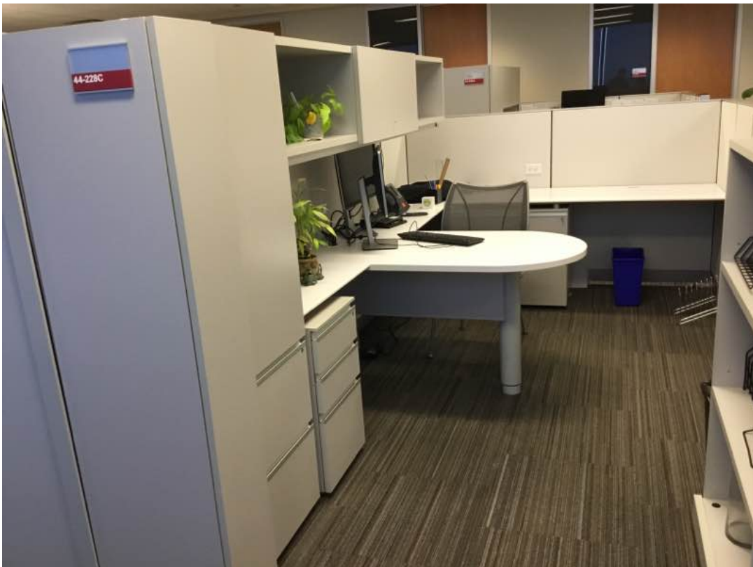
Manager station - 12' x 7'