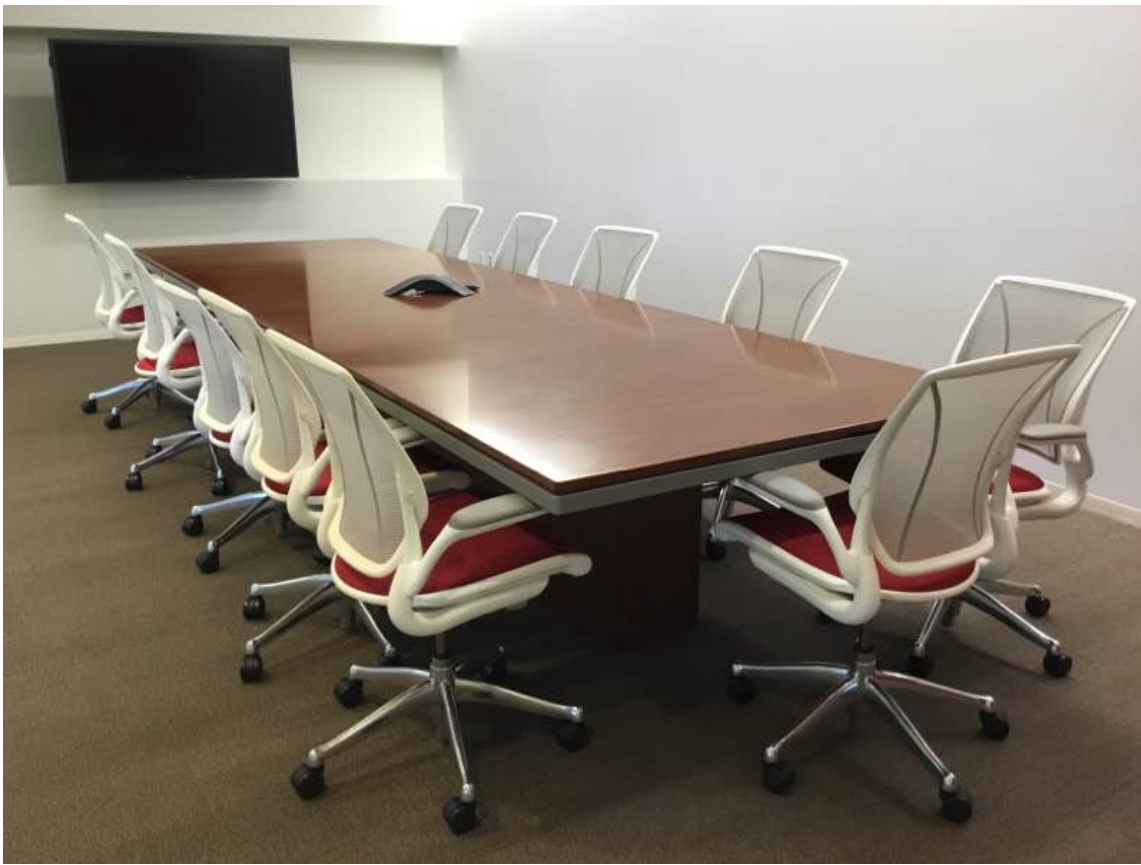
15' x 54"